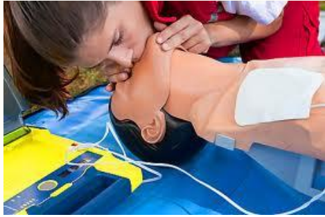
CPR and First Aid Instruction