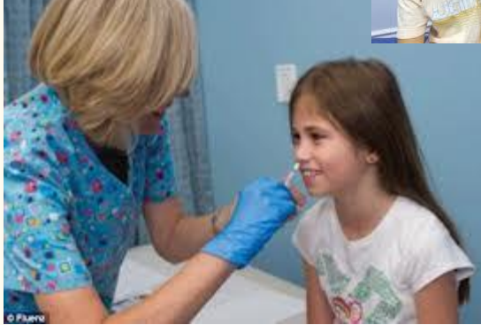
Flu Clinic Collaboration