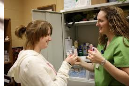
Health Office Activities