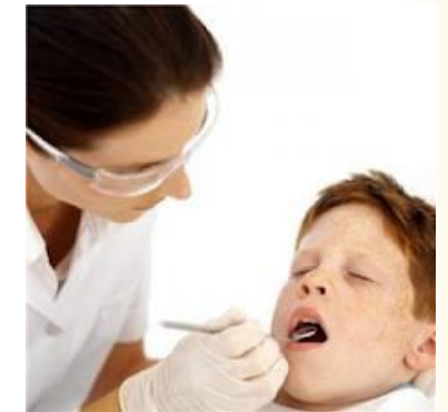
Dental Care Collaboration