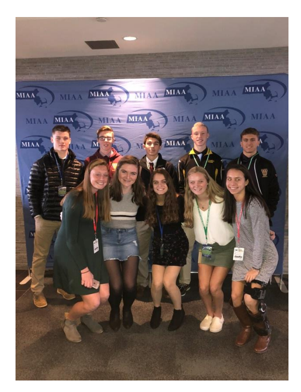
(10 of our student-athlete leaders attending the MIAA Sportsmanship Summit at Gillette Stadium)