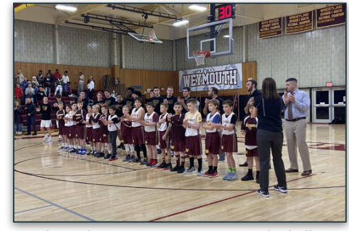
4th Grade WJBL at Varsity Boys Basketball Game

Winter season delayed to Dec 7th start date waiting on EEA guidelines to what will be played