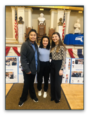
MIAA Girls and Women in Sports Day Celebration at Faneuil Hall