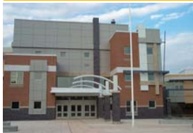
Weymouth High School