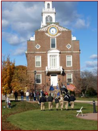
Government and Services